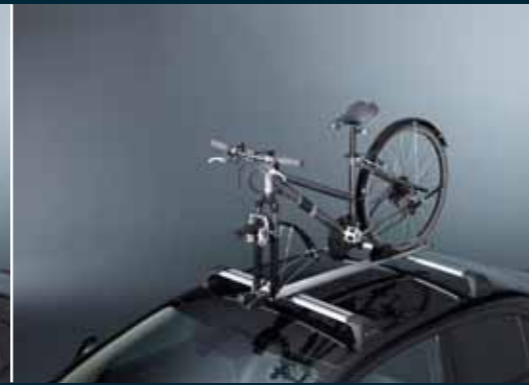
2 | Roof bicycle module 1 for transporting bikes with front wheel removed. Part No. 990E0-59J21-000