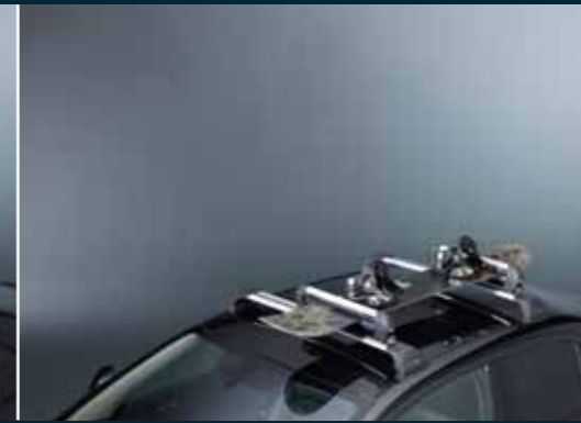
7 | Roof ski module 1 for 4 pairs of skies or 2 snowboards. Part No. 99000-990YT-106