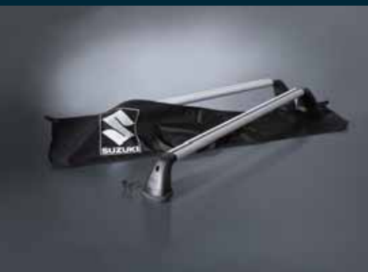
3 | Roof rack storage bag for roof rack, black with large Suzuki logo. Part No. 990E0-79J91-000