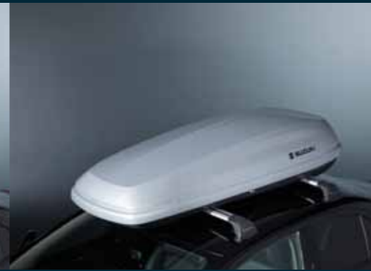
5 | Roof box 1 with universal clamp quicklock system, additional T-slot fixation not obligatory, can be opened from both sides, vol. 430l, 192 x 82 x 42 cm. Part No. 990E0-59J45-000