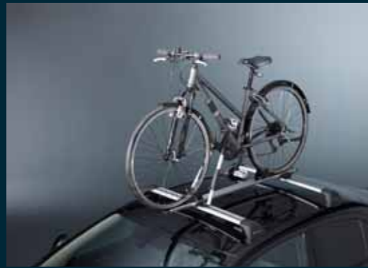
1 | Roof bicycle module 1 for transporting complete bikes. Part No. 990E0-59J20-000