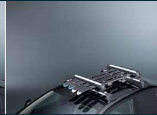
8 | Roof ski module 1 for 6 pairs of skies or 4 snowboards. Part No. 99000-990YT-107